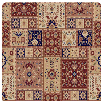
494B IMPRESSION BEIGE