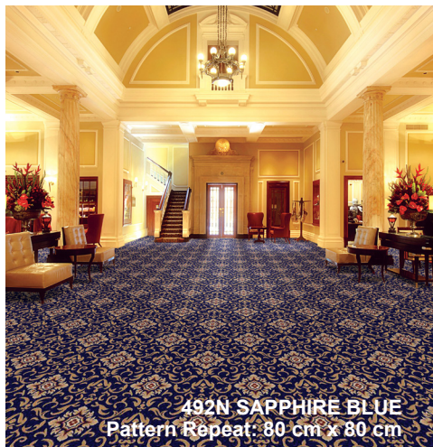
492N SAPPHIRE BLUE Pattern Repeat: 80 cm x 80 cm