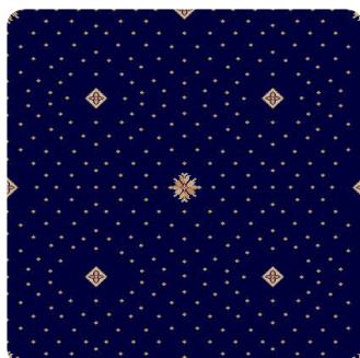
495N SPECTRUM BLUE