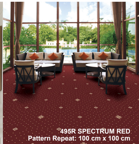
495R SPECTRUM RED Pattern Repeat: 100 cm x 100 cm