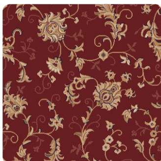
496R DIVINE RED