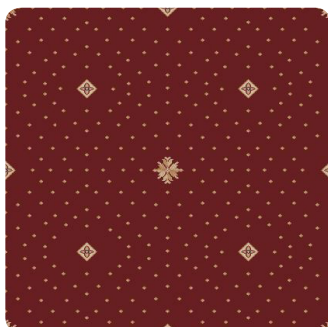
495R SPECTRUM RED