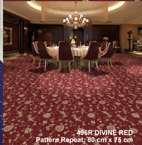
496R DIVINE RED Pattern Repeat: 80 cm x 75 cm