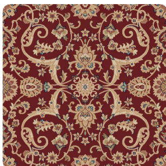
493R TOREADOR RED