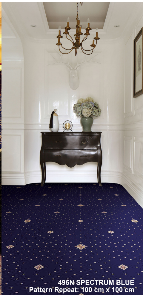
495N SPECTRUM BLUE Pattern Repeat: 100 cm x 100 cm