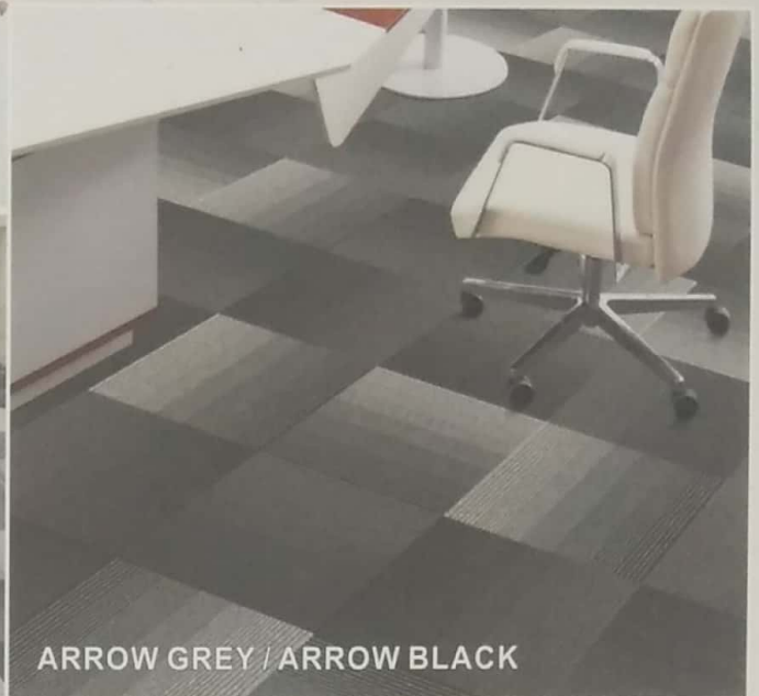
ARROW GREY / ARROW BLACK