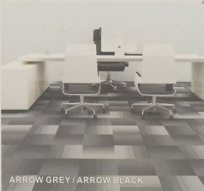
ARROW GREY / ARROW BLACK